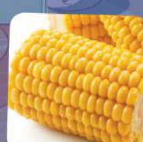
CORN ON THE COB