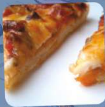
CHEESE AND TOMATO PIZZA