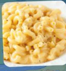
MACARONI CHEESE (V)