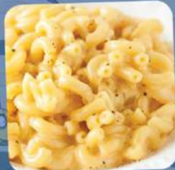
MACARONI CHEESE (V)