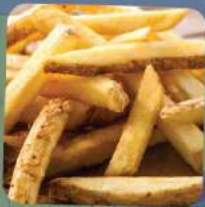
SKINNY ON FRIES