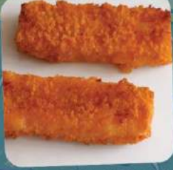
COD FISH FINGERS