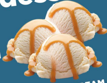
VANILLA ICE CREAM & DESSERT SAUCE