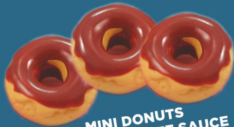
MINI DONUTS AND CHOCOLATE SAUCE