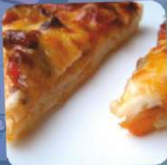
CHEESE AND TOMATO PIZZA