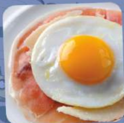
HAM AND EGG